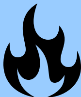
Probability of fire