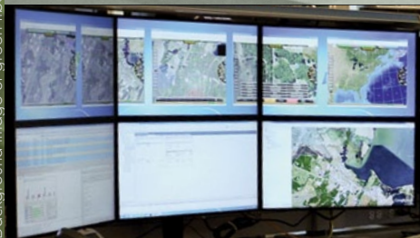
The Command, Control, Communications, Computers, Intelligence, Surveillance and Reconnaissance Systems Integration Laboratory (CSIL) of the U.S. Army is the site for all lab-based risk reduction for systems prior to Network Integration Evaluations.

Recommendations: The size and number of data centers in the U.S. and globally is expected to grow dramatically over the next decade to address the needs of a global digital society, especially if cloud services become more pervasive. These data centers will be the focal point for the development and deployment of new optics and photonics communications technologies.