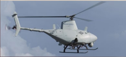
The XM157 Class IV Unmanned Aerial Vehicle (left) has a range and endurance appropriate for supporting the Brigade Combat Team Commander with communications relay, long endurance persistent stare, and wide area surveillance.

Recommendations: It is becoming increasingly clear that sensor systems are becoming the next “battleground” for dominance in intelligence, surveillance, and reconnaissance (ISR), with optics-based sensors representing a significant fraction of ISR systems. Ubiquitous knowledge across an area will be a huge defensive advantage, along with the ability to communicate information at high bandwidths and from mobile platforms. Speed of light attack can provide a significant advantage to U.S. forces. Defense against missile attacks, especially ballistic missiles, is another significant security need. These areas have been pursued primarily as separate technical fields, but it is recommended that they be pursued together to gain synergy.