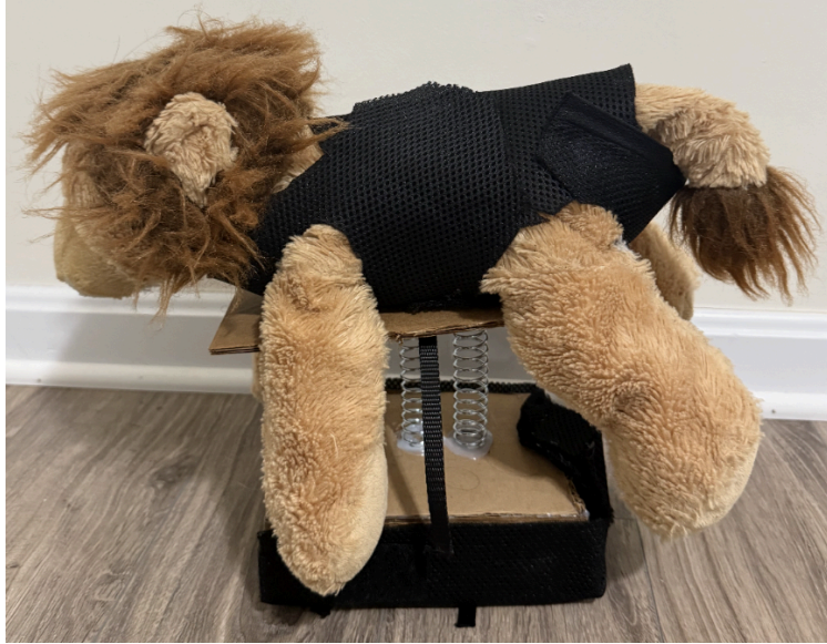
Figure 3: 1st prototype, a visual image of the wearable bodysuit on a cat-like model