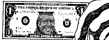
1978 — CARTER: 44c (August)