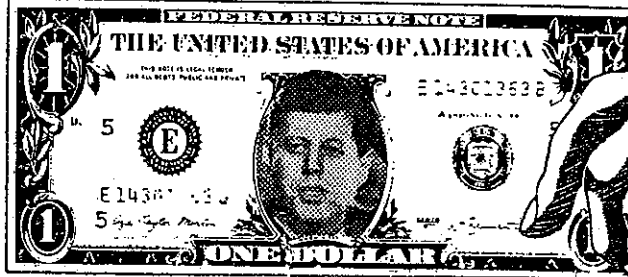
1963 — KENNEDY: 94c