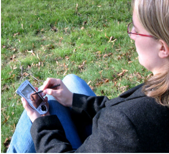
figure 1. Emerging interaction styles are moving into the real world in ways that would have been impossible for the previous generation of graphical user interfaces.