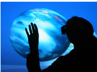
figure 2. Virtual reality interfaces feature interactions that are like the real world.

introduce the term Reality-Based Interaction for emerging interaction styles that share this common feature. We have identified two overlapping classes of reality-based interactions: those that are embedded in the real world , and those that mimic or are like the real world . Both types of interactions leverage knowledge of the world that users already possess—for operating the user interface itself and/or for combining the interface with other tasks in the user's environment.