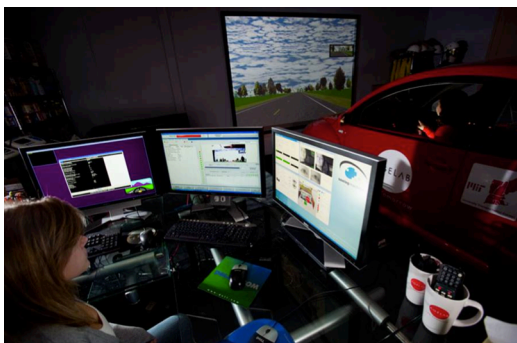
Figure 2. Driving simulation environment. The participants sit in the red car (shown in the back, right) and are instrumented with fNIRS and other physiological sensors (EKG, skin conductance). The screen in the front presents the simulated driving environment.

es are 1.5, 2, 2.5, and 3cm. Each distance measures a different depth in the cortex. Each source emits two near-infrared wavelengths (690 nm and 830 nm) to detect and differentiate between oxygenated and deoxygenated hemoglobin. The sampling rate is 6.25 Hz.