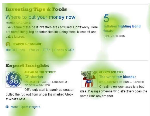
Figure 3. Standardized count heat map for Logos prototype