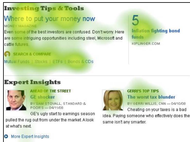
Figure 4. Standardized duration heat map for Faces prototype