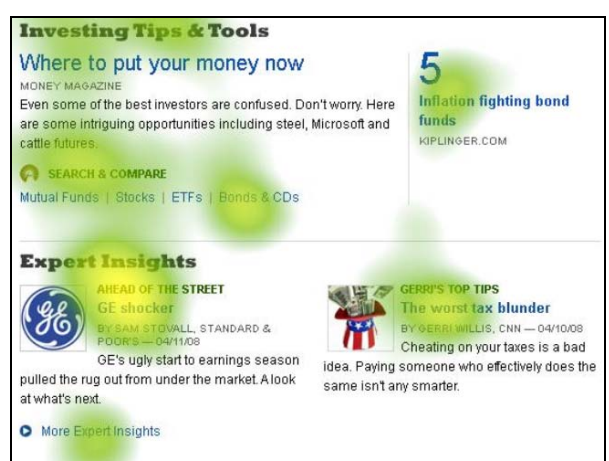
Figure 5. Standardized duration heat map for Logos prototype

Next, we used the standardized duration heat maps (Figures 4 and 5) to compare the amount of time participants fixated on areas across the prototypes. These reveal a longer fixation on the text next to the left image compared to the text next to the right image on the same page (both on the Faces and Logos prototypes).