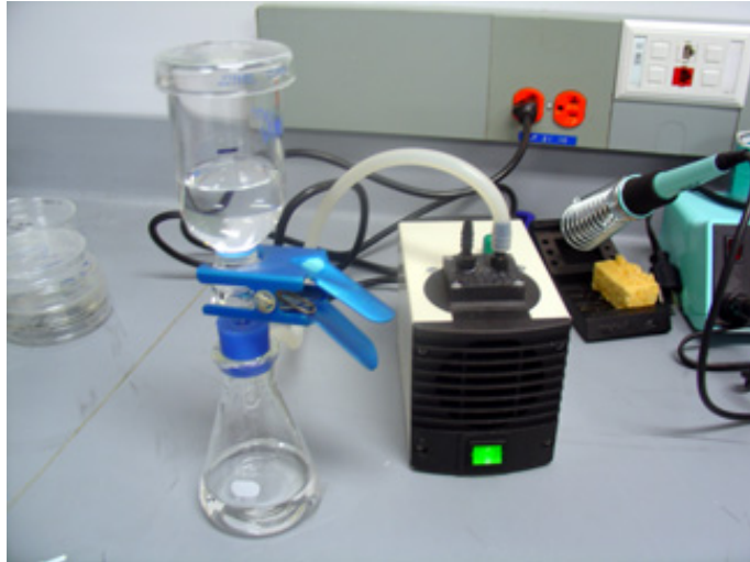
* A Millipore filtration system