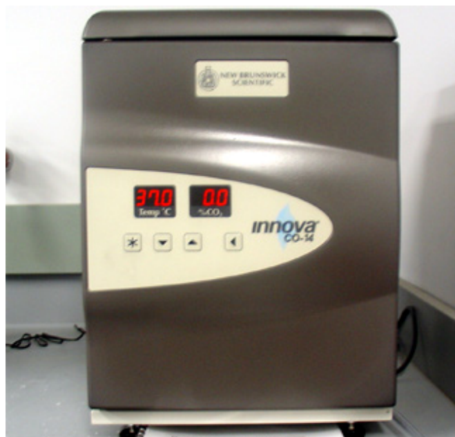
* A Fisher Scientific Isotemp tissue culture incubator