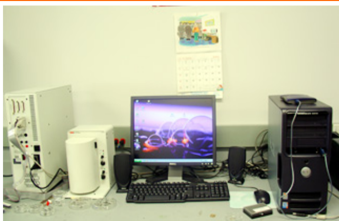
* A BAS electrochemical workstation