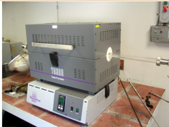
* A chemical vapor deposition (CVD) system