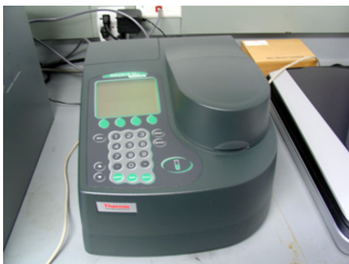
* A UV-visible spectrophotometer