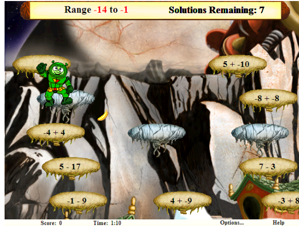
Figure 2. Crater Crossing.