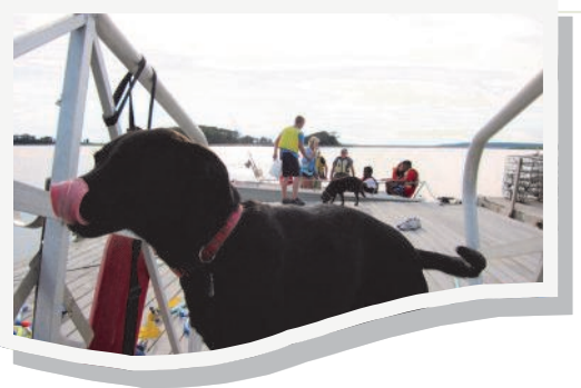
BRIARWOOD AUG 31-SEPT 2

“One of the best parts about Briarwood was getting to know different people. I had so much fun staying up late with the girls in my cabin, just talking and laughing. All of the activities were very fun as well. Kayaking was both relaxing and strenuous, fishing was fun and adventurous, swimming was refreshing, and ultimate frisbee was very competitive (or at least I thought so). The marine research and STEM mapping was enjoyable and informative. This experience has really made me more social and willing to talk to new people that I do not know.”