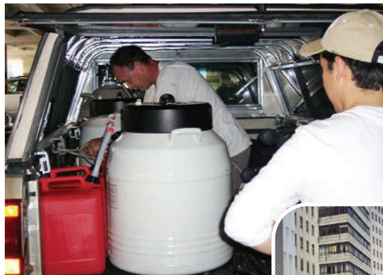
Rescue mission. Staff from Tulane's gene-therapy center bring Dewars of liquid nitrogen to retrieve adult stem cells from flooded research labs.