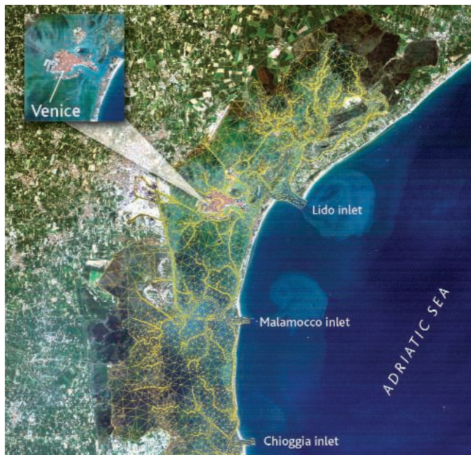
Complex interactions. A computer model, overlaid on a satellite image, divides the Venice Lagoon into thousands of interacting triangles to enable study of its processes, such as water flow and sediment transport.

For instance, Venice's record of sea-level change is now the most comprehensive in the world. Modern records of watermarks go back to the late 19th century, and researchers are finding ways to push the data farther back in time. A Venetian tradition of painting scenes with the help of camera obscura projections, the pinhole predecessor to photography, has left researchers with accurately scaled images of the green algae lines